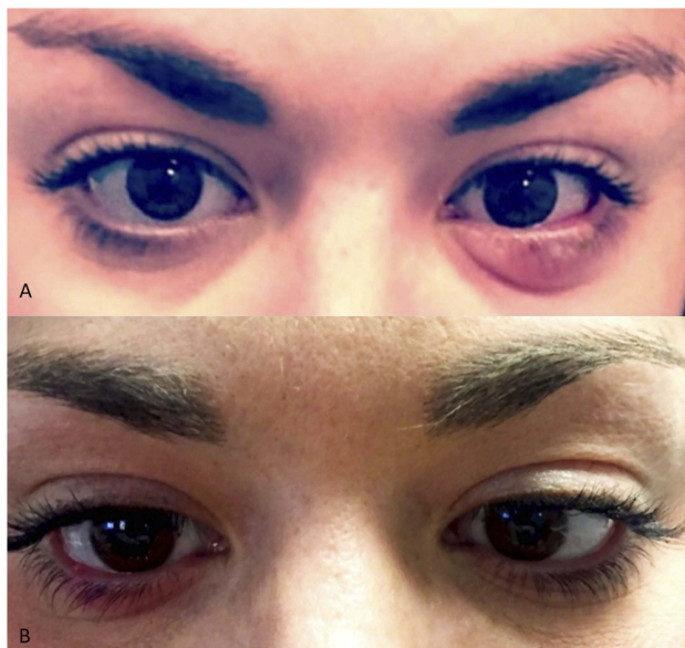
Figure 2 An adult patient before LLLT treatment (A), and 2 weeks after treatment (B). Images used with permission.

chalazia and treatment specifics were extracted from the file, along with the results of the treatment.